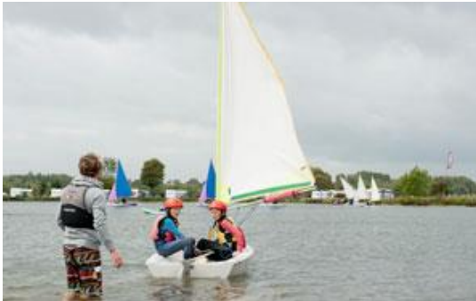
12 acre lake