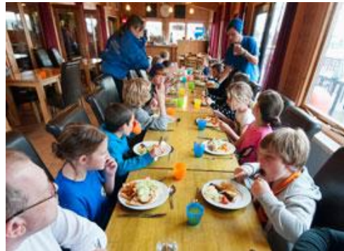
Bar & eatery