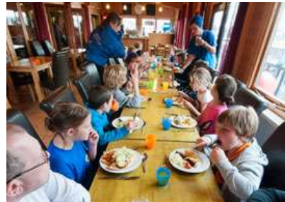
Bar & eatery