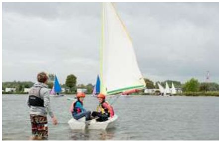
12 acre lake